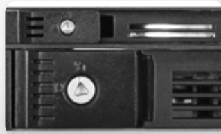
Security key lock