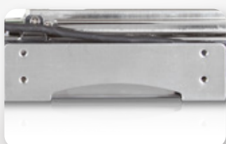
ABS Plastic and stainless steel