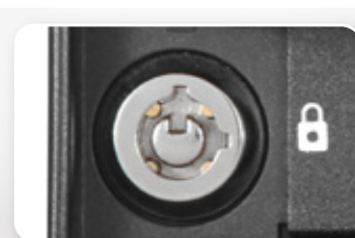
Security key lock