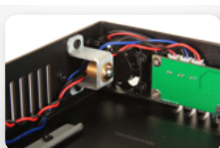
HDD Snap in design